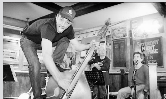
The Barley Dogs are at the Markets Square from 12.30 to 2pm. (0913971)