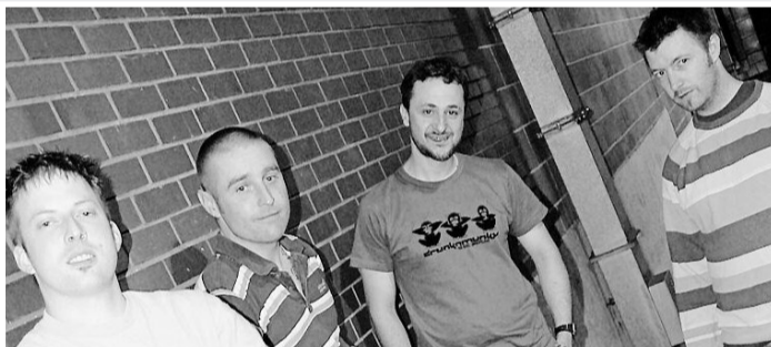
[spunge] are ready to jump on demand.